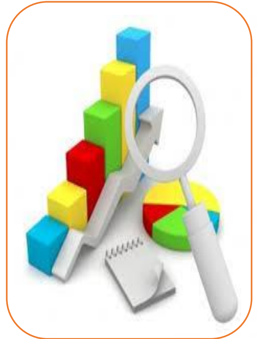
Full Visibility of the Field from HQ in Real-Time

ChannelMonitor is made up of a Mobile platform for field staff to plan, take notes, capture data on visibility, products, customers, merchandise and take orders real time on the field with time and location stamps. It also comprises of an Analytics platform which enables the Manager to effectively and efficiently manage its field force, view field activities and generate various insights to influence activities for desired result.